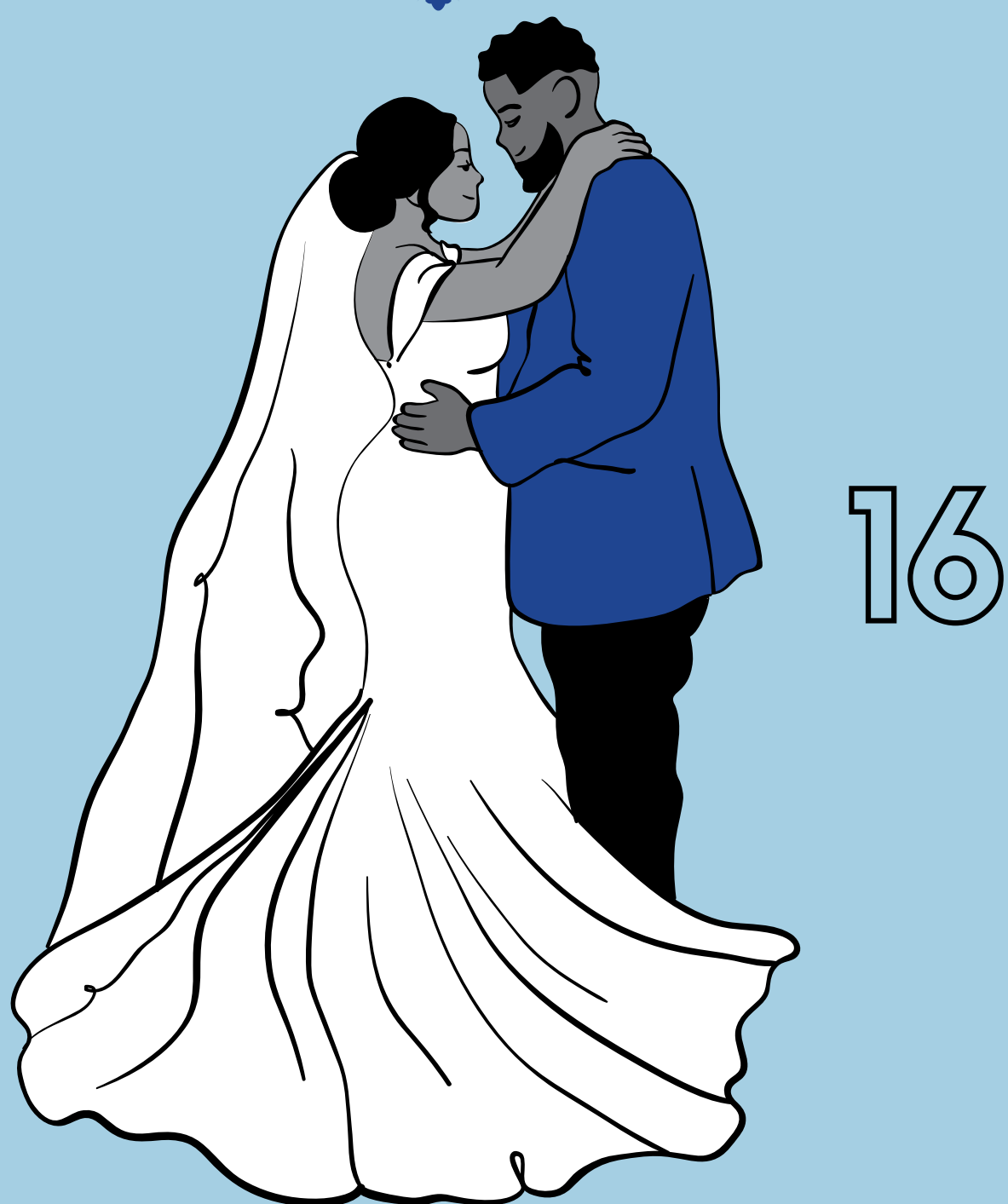
Certificate of Marriage