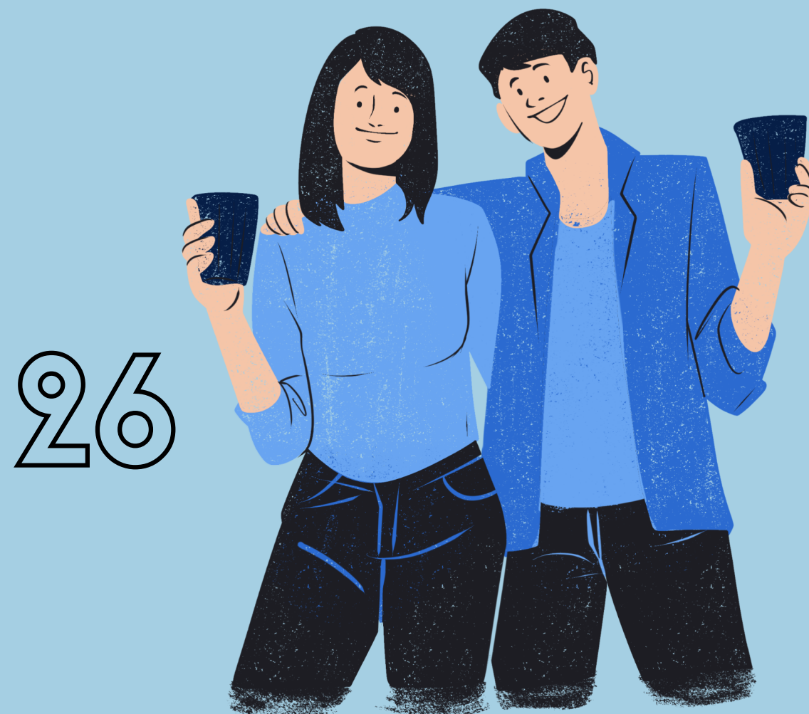
Certificate of No Marriage/Advisory on Marriage