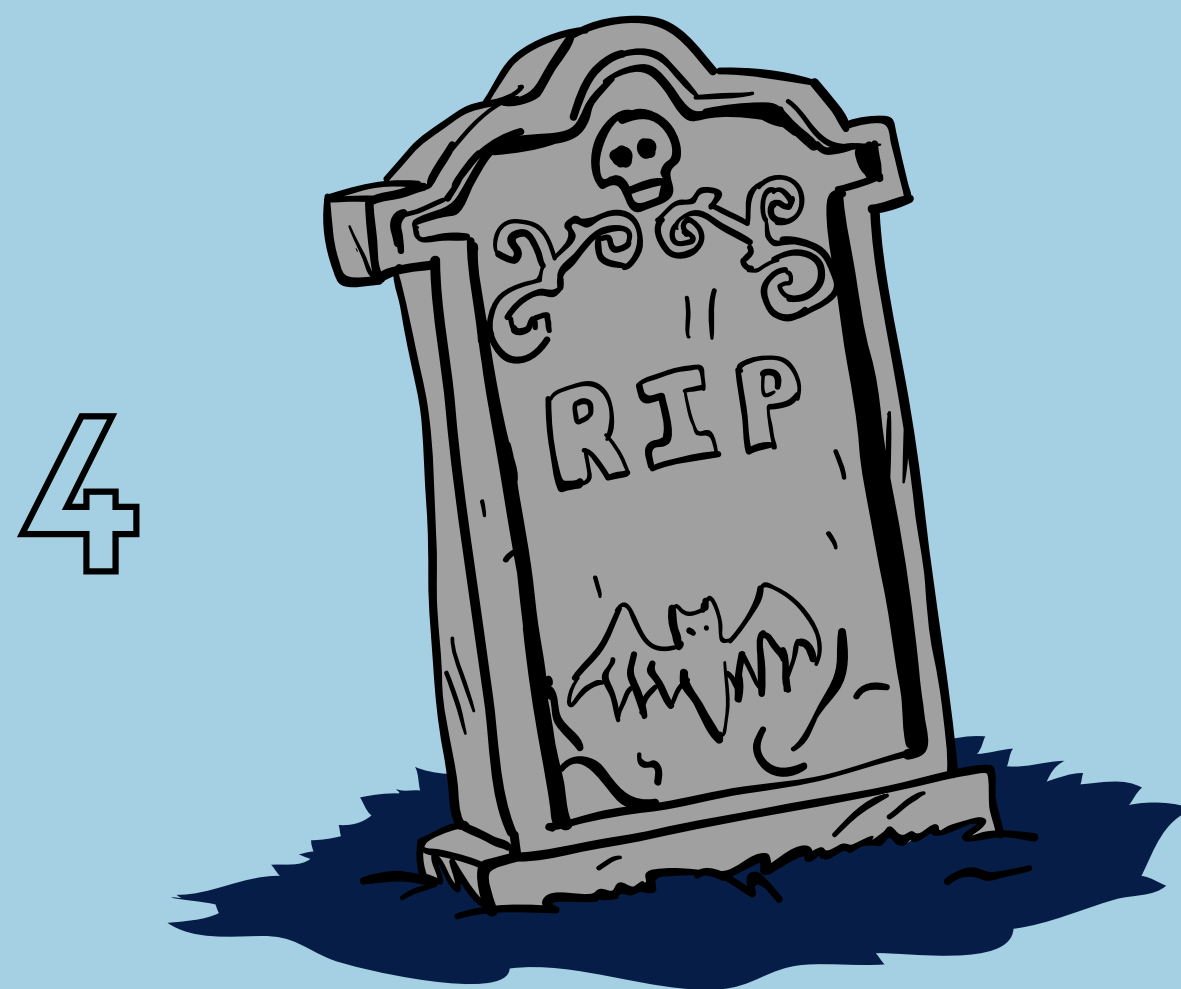
Certificate of Death