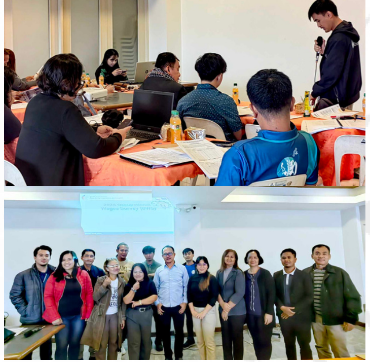
Second-Level Training for the 2024 Occupational Wages Survey (OWS) and the 2023/2024 Integrated Survey on Labor and Employment (ISLE) on September 3-6, 2024 held at Prince Plaza Hotel, Baguio City.

The Philippine Statistics Authority (PSA) -Kalinga launched the 2024 Occupational Wages Survey (OWS) and the 2023/2024 Integrated Survey on Labor and Employment (ISLE) roll-out on September 30, 2024, with a total of 27 sample establishments. Both surveys are biennial, establishment-based initiatives conducted every two years and following the same sample, survey design, and operational strategies used in field operations.