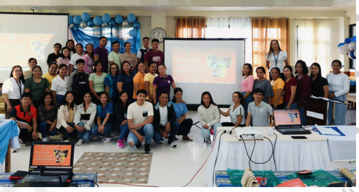
Third-Level Training for the 2024 Functional Literacy, Education, and Mass Media Survey on September 23-27, 2024 held at Las Vegas Hotel and Restaurant

Prior to the operation, SRs and TS underwent a five-day comprehensive training from September 23 to 27, 2024 held at Las Vegas Hotel and Restaurant.