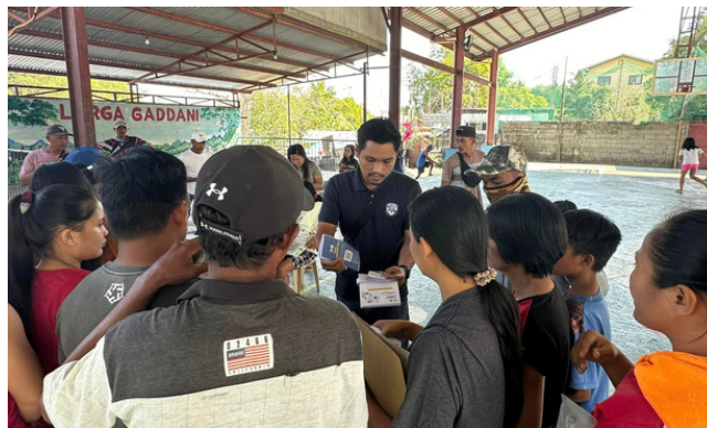
PHOTOS: PSA-Abra PRT Steps Up PhilSys Step 2 Registration Efforts