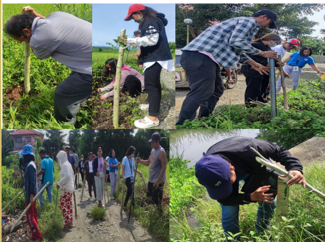
PSA personnel and Barangay Officials of Cabatacan, Pudtol with participation of State Auditor II Benjamin M. Bamba Jr., who happened to be on official business at PSO - Apayao

Planting of malunggay, also known as Moringa and considered as "miracle tree" because of its many medical benefits, were both planted by PSA personnel and barangay officials at Cabatacan, Pudtol, Apayao on September 12, 2022.