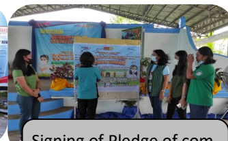
Signing of Pledge of commitment