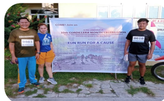
Fun run for a cause

A Fun Walk on the twilight of August 4, 2022 from San Isidro Sur to Poblacion, Luna, Apayao was participated by PSA personnel with other agencies. Another clean up drive on August 18, 2022 at San Isidro Elementary School, San Isidro Sur, Luna. Apayao.