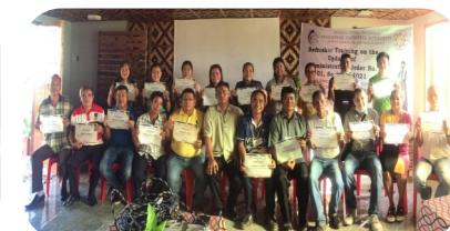
Participants from the different Religious Sectors of Apayao Province.