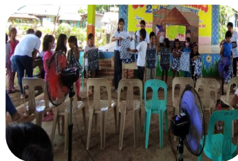
Balasi Elementary School, Balasi, Flora, Apayao, August 12, 2022