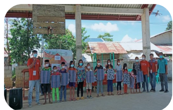
San Juan Elementary School, Sta. Marcela, Apayao, August 31, 2022