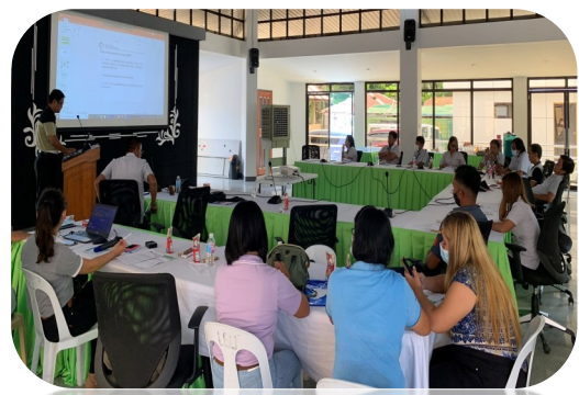
Participants of the PhilSys ID from the various offices of said municipality.

The topics that was tackled were Introduction to National Identification, Registration steps/process and requirements needed during registration.