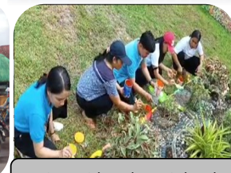
At San Isidro Elem. School