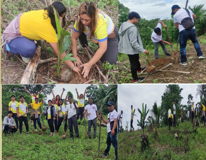
PSA Personnel during their tree planting activity at San Mariano, Pudtol

In support to the National Greening Program of the government and creating awareness on the importance of serving and protecting the environment and preservation, personnel of PSA Apayao conducted coconut tree planting at Barangay San Mariano, Pudtol municipality on September 9, 2022.