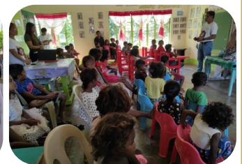
Atok Elementary School, Atok, Flora, Apayao, August 12, 2022