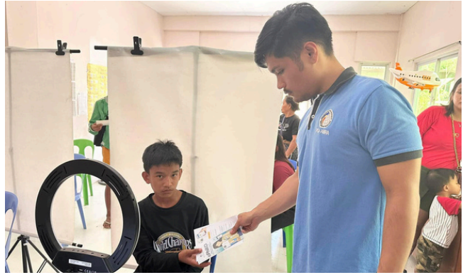
PHOTOS: PSA-Abra PRT Steps Up PhilSys Step 2 Registration Efforts and Distribution of PhilSys IEC campaign materials