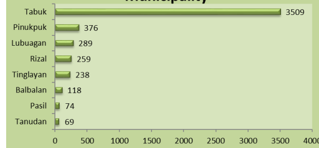
2020 Kalinga Registered Births by Municipality

Source: Monthly Vital Events Report, Kalinga