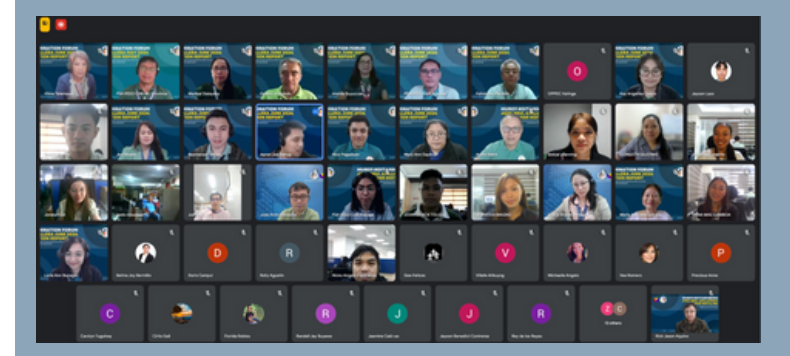
CORDILLERA ADMINISTRATIVE REGION AVERAGE INFLATION AS OF JULY 2024

The Chief Statistical Specialists of the PSA Provincial Statistical Offices in CAR, presented the inflation report of their respective provinces. The online dissemination of the July 2024 Cordillera Inflation Report was conducted last 21 August 2024 via Google Meet. This was attended by 70 participants from Regional Line Agencies (RLAs), Local Government Units (LGUs), academe, and the media.