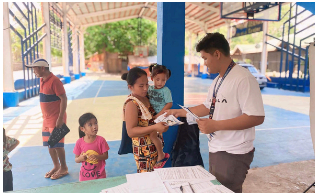
PHOTOS: PSA-Abra PRT Steps Up PhilSys Step 2 Registration Efforts and Distribution of PhilSys IEC campaign materials