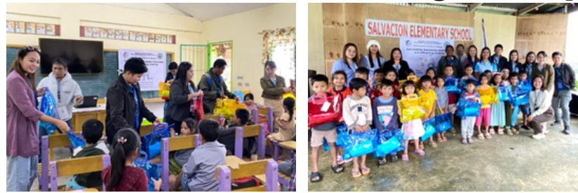
PSO Apayao personnel handling gifts to the learners.

On January 16, a gift-giving activity was held at Salvacion Elementary School, thanks to the generous sponsorship of the Provincial Local Government Unit (PLGU) of Apayao, through a request from this office.