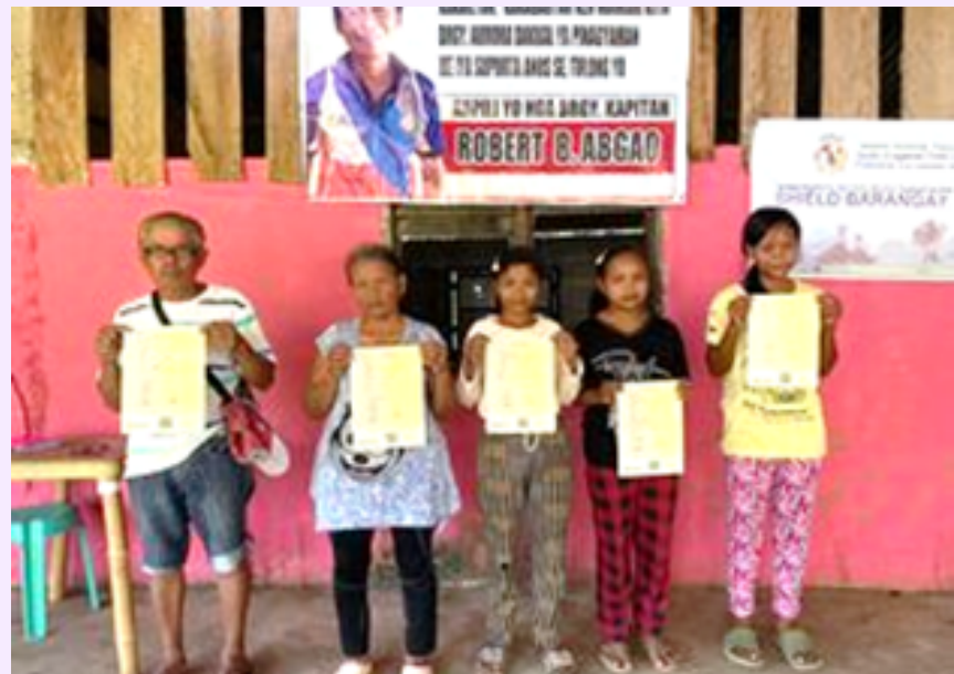
SecPa Distribution in Pudtol