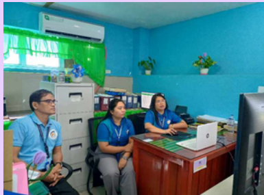
Provincial Data Review of Retail Price Survey (on the left) and Quarterly Fisheries Survey (on the right).