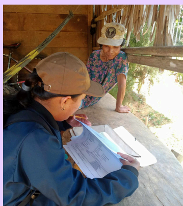
Statistical Researchers collecting data on various surveys