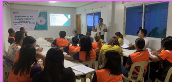
Municipal CBMS Convening Board of Pudtol (upper photo) and Calanasan (lower photo)