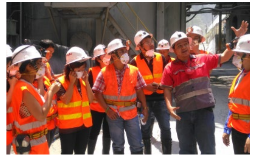
Philex Mines representative orients participants on mining operations.

A visit to the underground tunnels of Philex Mines Corporation located at Padcal, Tuba, Benguet gave the participants with a brief underground mining experience, and an appreciation of the operations and processes involved in extracting mineral resources and how these are accounted for by the company. The Philex Mines Operations Department also informed the government agencies about the environmental and community relation programs that the mining company is implementing as its corporate social responsibility. - JRB