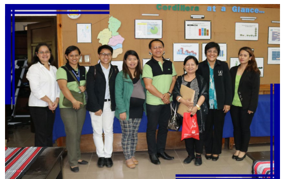
RSC members and the Secretariat pose for a photo after the RSC meeting.