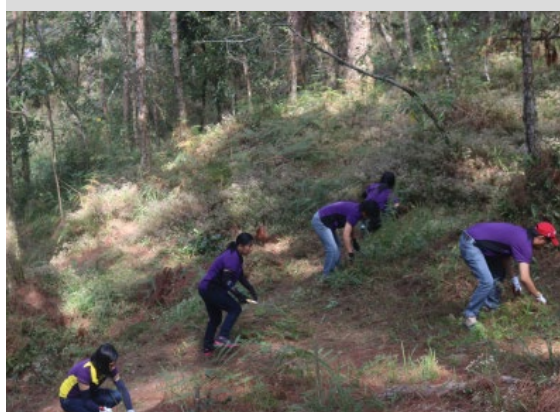
PSA-CAR and Benguet Provincial Staff ended women's month celebration with weeding and clearing activity at the PSA- adopted forest site, Busol Watershed - AMC