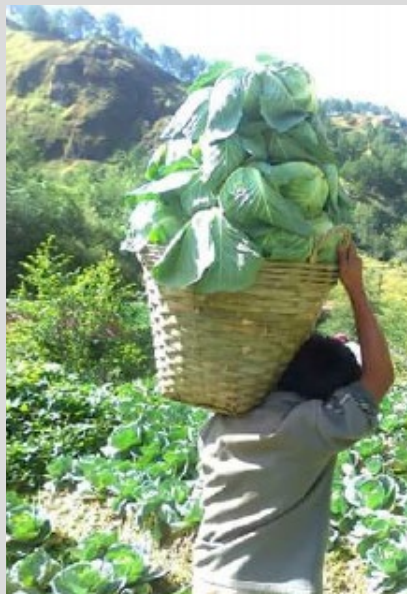
Mr. Mateo, the PSA cabbage man carries newly-harvested cabbage to a waiting vegetable truck dealer.