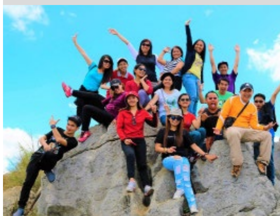
"Who says we cannot touch the sky?" - at Mt. Yangbew. - AMC

In honor of women's contribution to all aspects of development in society, and to step-up initiatives on gender equality, women empowerment, and women's rights and welfare, International Women's Month is celebrated every month of March. In the Philippines, March 8 of every year was declared as National Women's Day by virtue of Republic Act No. 6949 issued by then President Corazon Aquino on April 10, 1990. The Act encourages all government agencies, instrumentalities and the private sector to engage and participate in all activities in celebration of women's day.