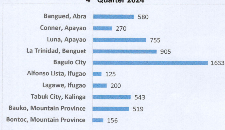
Figure 2. Cities/Municipalities with Most Registered Live Births: CAR 4 th Quarter 2024