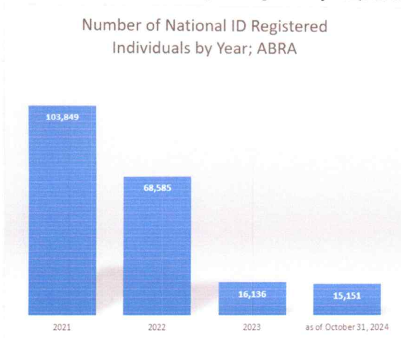
Figure 1. Number of National ID System Registered by Year; ABRA