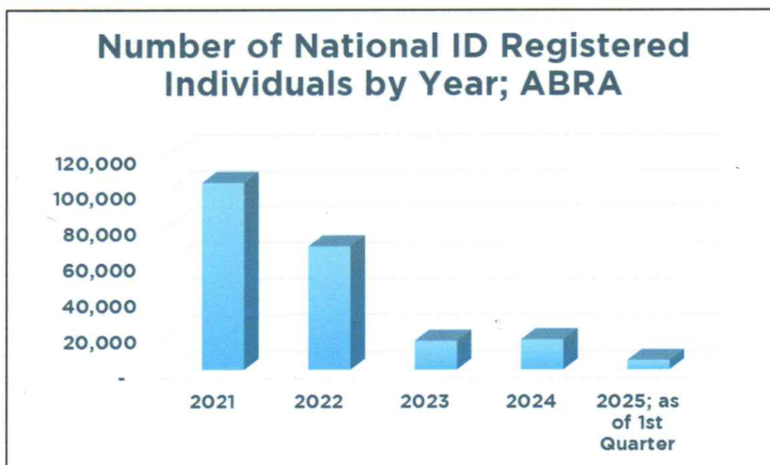
Figure 1. Number of National ID System Registered by Year; ABRA