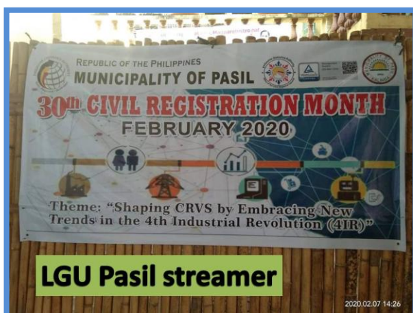
LGU Pasil streamer

Local Government Units of Pasil and Pinukpuk, Kalinga prepared and hanged their streamer also in front of their offices.