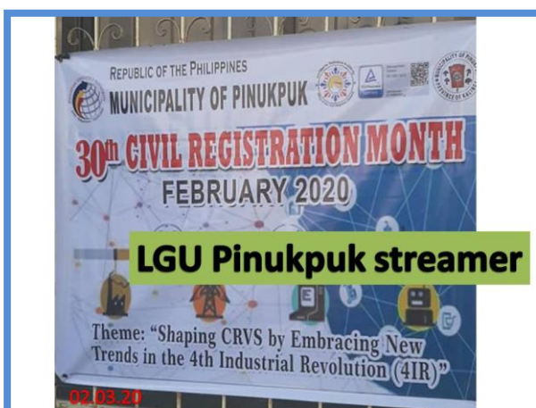
LGU Pinukpuk streamer

Local Government Unit of Rizal and Tabuk City, Kalinga prepared and hanged their streamer also in front of their offices.