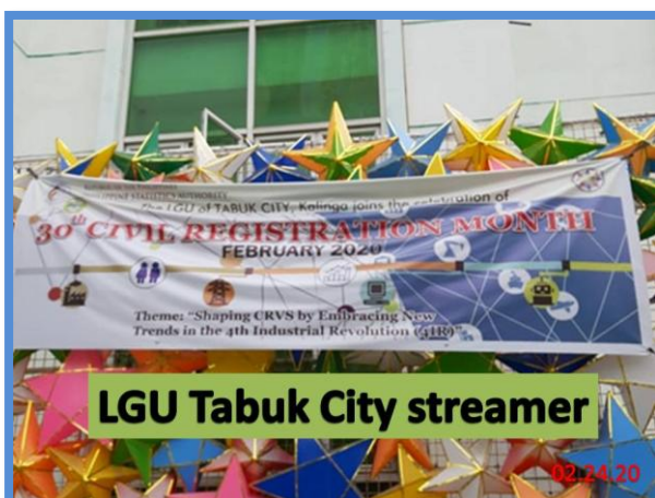
LGU Tabuk City streamer