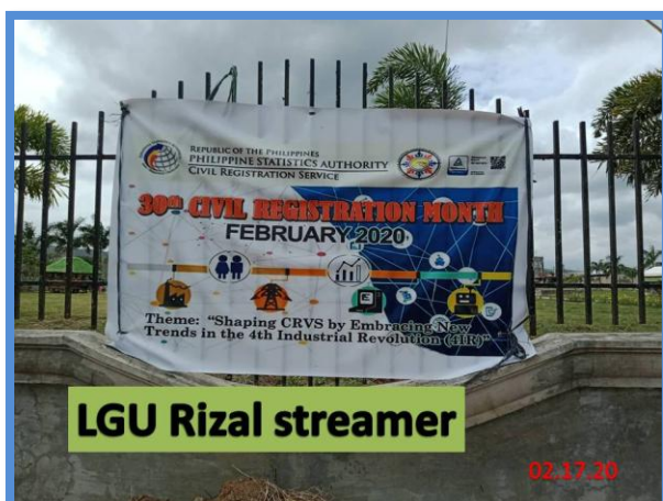
LGU Rizal streamer

Local Government Unit of Rizal and Tabuk City, Kalinga prepared and hanged their streamer also in front of their offices.