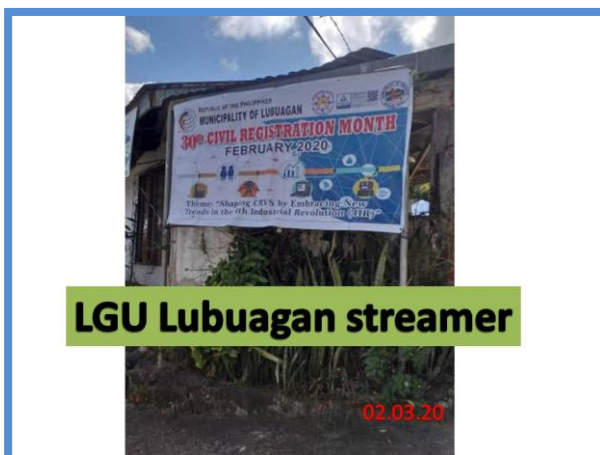
LGU Lubuagan streamer

Local Government Units of Pasil and Pinukpuk, Kalinga prepared and hanged their streamer also in front of their offices.