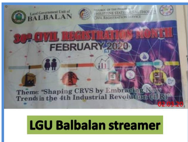
LGU Balbalan streamer

Local Government Units of Balbalan and Pasil, Kalinga prepared and hanged their streamer also in front of their offices.