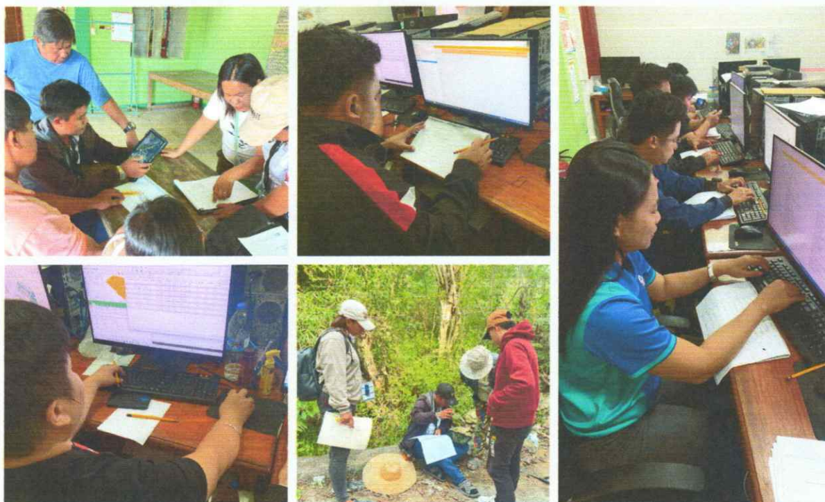
IN PHOTOS: Data Collection and Processing on 2024 POPCEN-CBMS Geotagging of SFGP

Date of Release : 23 April 2025 Reference No. : 2025CAR01-PR-15