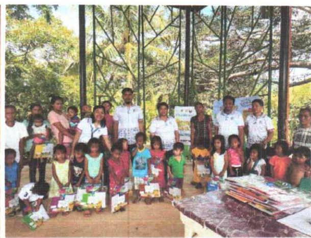
PSA Abra personnel giving school supplies to pupils aged 1-4-year-old of Sabangan Elementary School.

02 September 2024 – TINEG, ABRA. The Philippine Statistics Authority (PSA) Abra Provincial Statistical Office (PSO) successfully conducted the “Rehistro Bulilit” Campaign at Sabangan Elementary School (ES), Sitio Sabangan, Alaoa, Tineg, Abra on 29 August 2024. The campaign aimed at encouraging parents/guardians to register their children to the National ID System and to bring the National ID registration services to the remaining unregistered population below five years old and also all residents who are not yet registered.