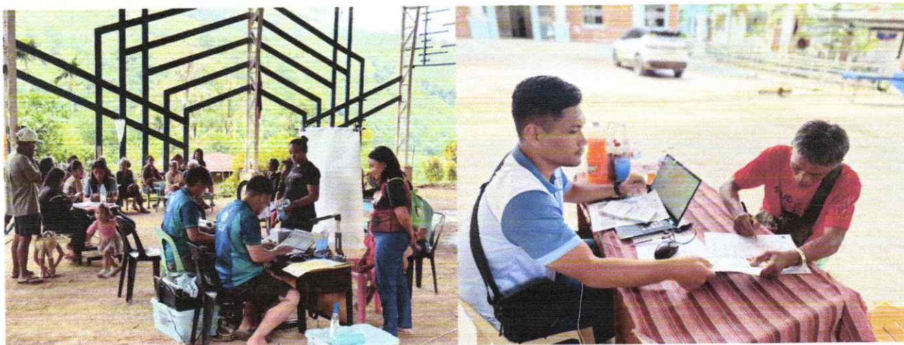
IN PHOTOS: Left: RKOs Biares & Villamor rendering NID mobile registration services at Bacag, Lacub Right: RO II Aveño distributing NID IEC campaign materials

Date of Release : 14 July 2025 Reference No. : 2025CAR01-PR-022