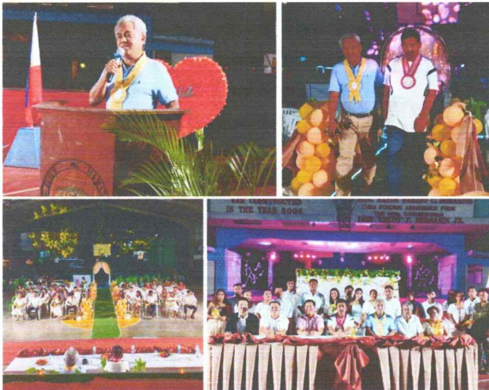
IN PHOTOS: (clockwise) 1: CSS Perdido delivering his message; 2: CSS Perdido and LCE Domasing during the procession rites; 3: Photo opportunity during the event; and 4: CSS Perdido and LCE Domasing in the venue

Date of Release : 13 February 2025 Reference No. : 2025CAR01-PR-08