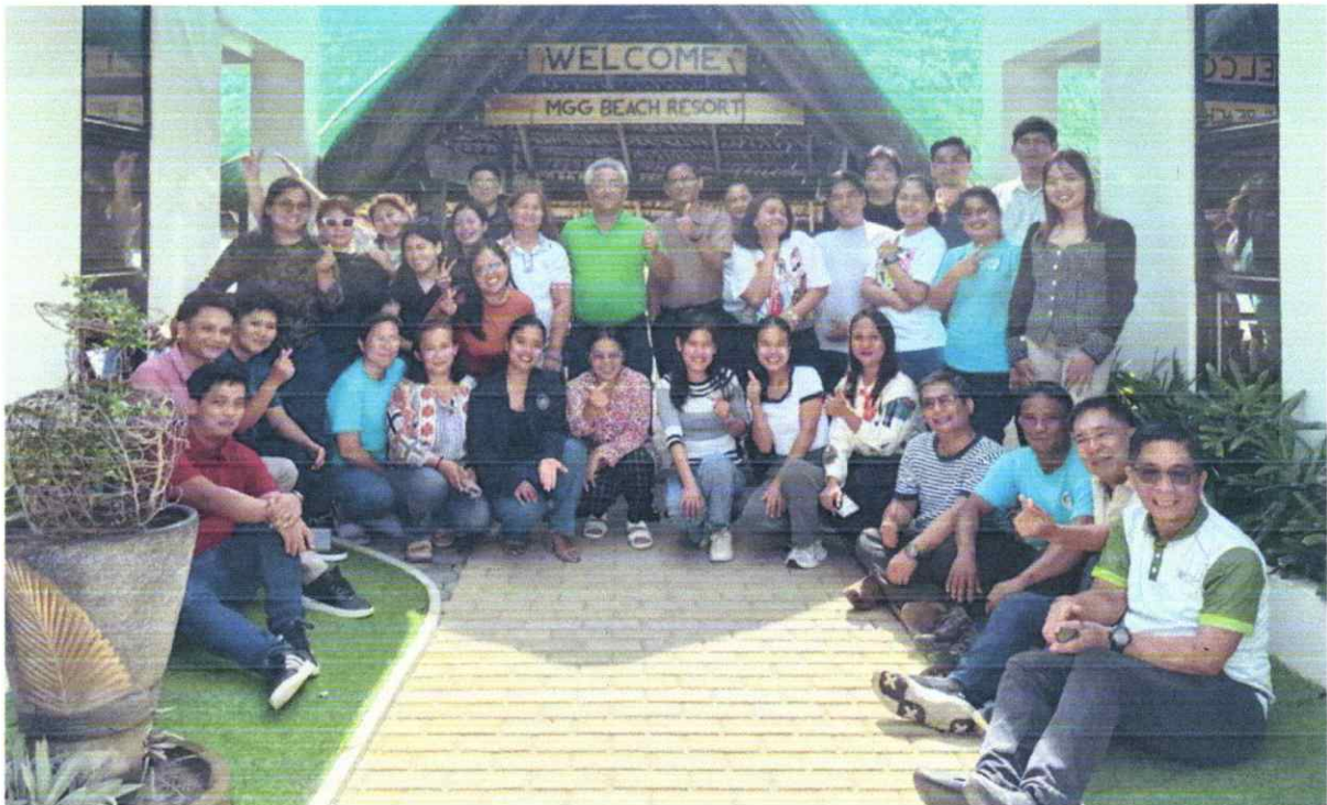
IN PHOTO: Photo opportunity of PSOs Abra & Apayao during the conduct of 2025 joint MYPR & PPW

29 July 2025 – BANGUED, ABRA. The Provincial Statistical Offices (PSOs) of Abra and Apayao successfully concluded their joint 2025 Midyear Performance Review (MYPR) and Provincial Planning Workshop (PPW) from July 16-18, 2025, at MGG Beach Resort in San Vicente, Ilocos Sur. The three-day intensive workshop brought together personnel from both provinces to collectively assess their accomplishments for the first half of 2025, identify challenges encountered, and recalibrate strategies to enhance PSO operations in the coming months.