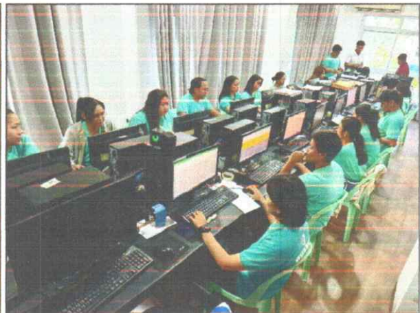
Hired 2024 POPCEN-CBMS Map and Data Processors

15 November 2024 – BANGUED, ABRA. The Philippine Statistics Authority (PSA) has completed the 2024 Census on Population and Community-Based Monitoring System (POPCEN-CBMS) Data Collection in September 2024. To ensure the quality of the collected data, the PSA implemented rigorous measures, including close supervision and re-interviews conducted by PSA regular personnel prior to the conclusion of data collection. One of the key quality control measures also is the Map and Data Processing. This critical step ensures the precision of the collected data. As emphasized in Rule II of the Republic Act No. 11315, otherwise known as the “Community-Based Monitoring System Act”, Implementing Rules and Regulations (IRR), this procedure entails analyzing raw data and is essential for identifying and addressing potential errors, anomalies, and inconsistencies, ultimately enhancing the accuracy and utility of the community-level data. The Abra Provincial Statistical Office (PSO) hired six (6) Map Data Processors (MDP) and 14 Data Processors (DP). The 2024 Map and Data Processing commenced on September 11 until November 23, 2024. Another key measure that the PSO is implementing is the Saturation Field Drive. This strategy is initiated to verify the initial