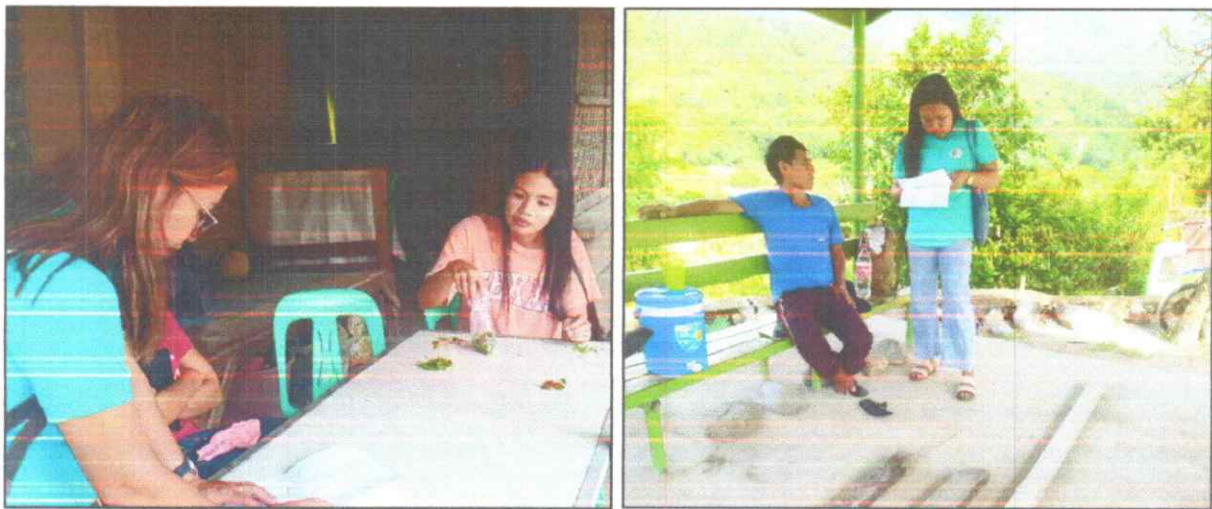
Hired Statistical Researchers (SRs) conducting 2024 POPCEN-CBMS Saturation Field Drive

For more information and inquiries about PSA, contact us at (074) 752-8031 or email us at abra@psa.gov.ph or you can visit the PSA Abra Provincial Statistical Office located at DZPA Bldg., Rizal St., Zone 6, Bangued, Abra. You can also access the official website of PSA-RSSO CAR at https://rssocar.psa.gov.ph/ , or message the PSO Abra Official Facebook Page https://www.facebook.com/PSACARAbra/ .