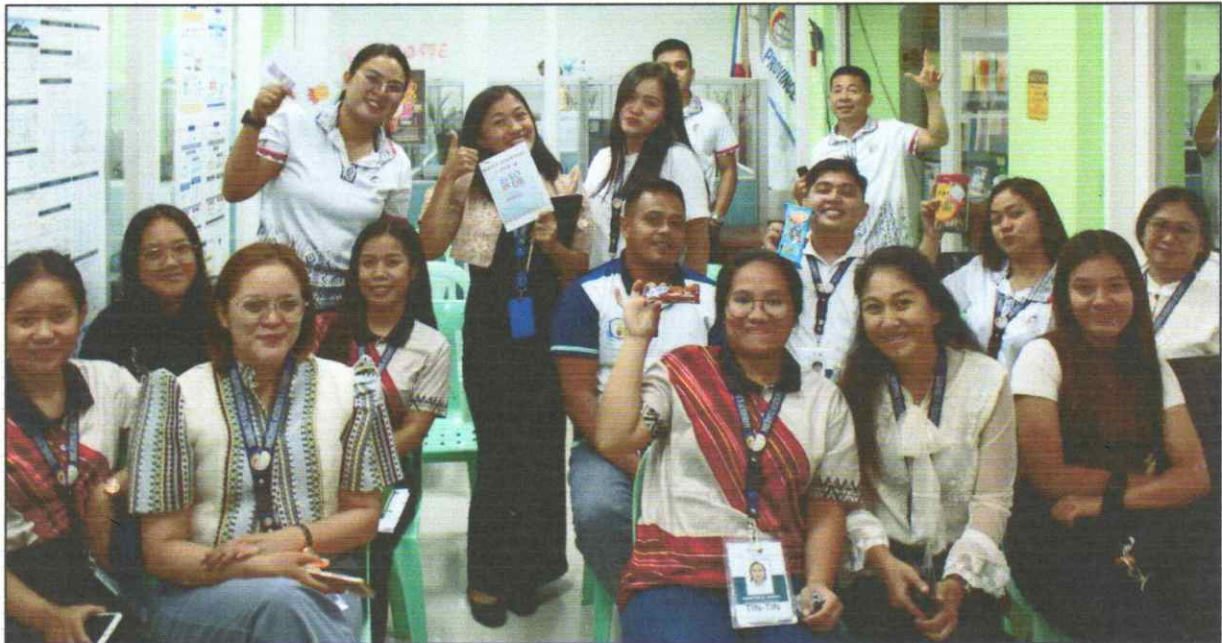
Photo Opportunity with the participants of 2025 EODB Month lecture

For more information and inquiries about PSA, contact us at (074) 752-8031 or email us at abra@psa.gov.ph or you can visit the PSA Abra Provincial Statistical Office located at DZPA Bldg., Rizal St., Zone 6, Bangued, Abra. You can also access the official website of PSA-RSSO CAR at https://rssocar.psa.gov.ph/ , or message the PSO Abra Official Facebook Page https://www.facebook.com/PSACARAbra/ .