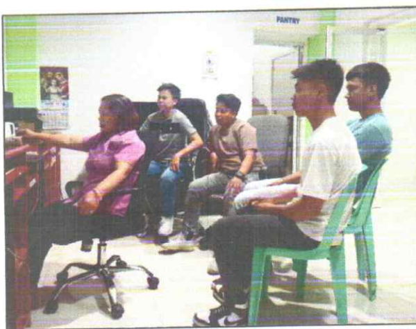
SS II Panabang discussing the varieties of crops to the hired statistical researchers

Date of Release : 21 March 2025 Reference No. : 2025CAR01-PR-11