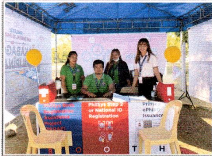
10 February 2023 - Opening day of PSA booth at Capitol grounds.

The PhilSys personnel in Tabuk City were in charge of the PSA booth which operated from 8:00 a.m. to 5:00 p.m. daily. YKalingas and other visitors from other provinces went to register and avail other services. The PSA booth aims to publicize the services offered by the agency especially to the constituents of Kalinga.