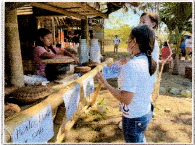
Distribution of PhilSys brochures and information dissemination regarding the PSA services offered in the Capitol grounds

In line with Organizational Goal IV of the PSA, to ensure inclusive, secured, and sustainable national identification system, the PhilSys personnel distributed the PhilSys brochures to continuously inform the public about the services of the agency.