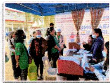
PSA Kalinga booth at the Capitol Hills, Bulanao, Tabuk City, Kalinga during the 4 th Bodong Festival in the province.

22 February 2023, Tabuk City, Kalinga - As part of the 4 th Bodong Festival celebration, different government agencies in the province, including the Philippine Statistics Authority (PSA)-Kalinga established booths in the Capitol grounds and offered different services such as: Philippine Identification System (PhilSys) Registration; Issuance of Printable ID; PhilSys Birth Registration Assistance Project (PBRAP); and assistance in availing of the Civil Registration Services (CRS).