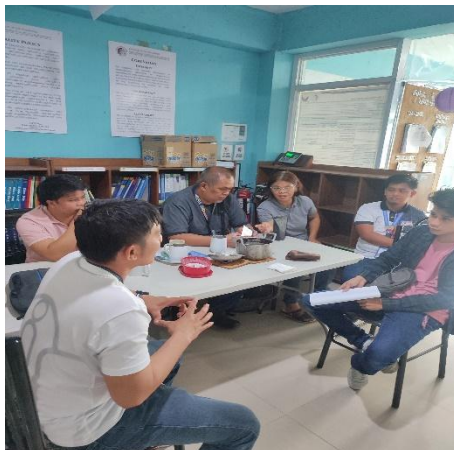
Photo during the group discussion