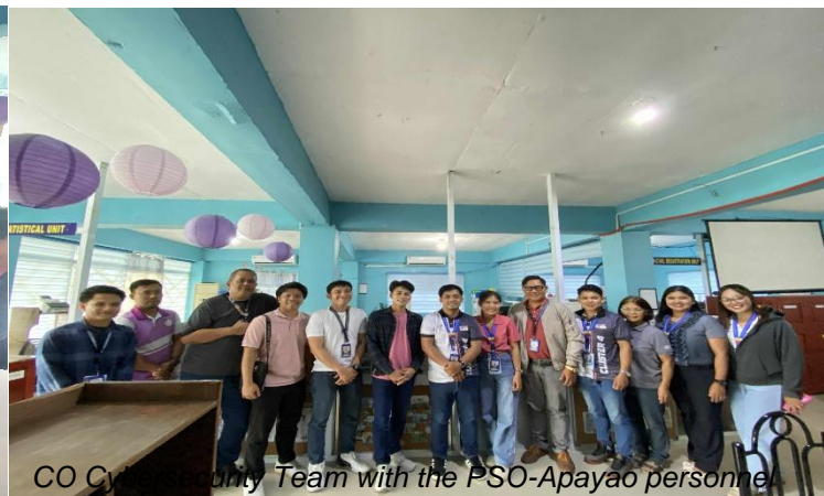
CO Cybersecurity Team with the PSO-Apayao personnel