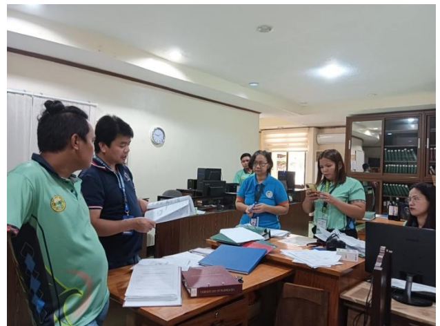
Audit Team in action