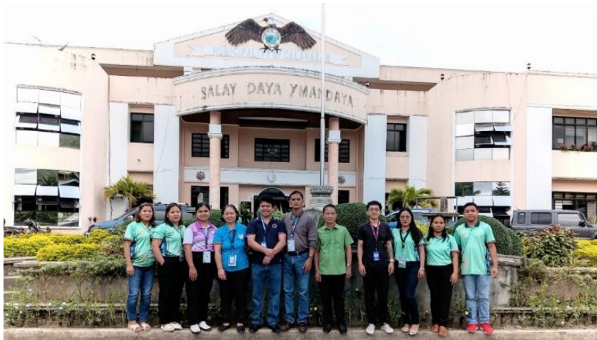
Audit Team with LCRO Calanasan personnel in front of the Municipal Hall