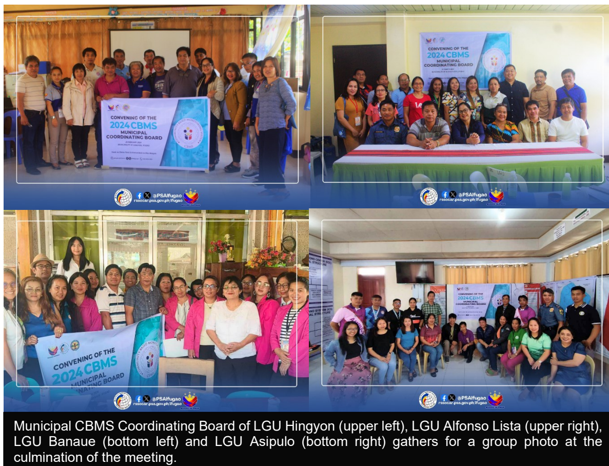
Municipal CBMS Coordinating Board of LGU Hingyon (upper left), LGU Alfonso Lista (upper right), LGU Banaue (bottom left) and LGU Asipulo (bottom right) gathers for a group photo at the culmination of the meeting.

Key presentations during the convenings elucidated the objectives, scope, and coverage of the 2024 CBMS initiative. Participants gained insights into the overarching framework of CBMS and the roles and responsibilities delineated for CCB members. Moreover, discussions delved into potential avenues for collaboration and support to optimize CBMS operations.