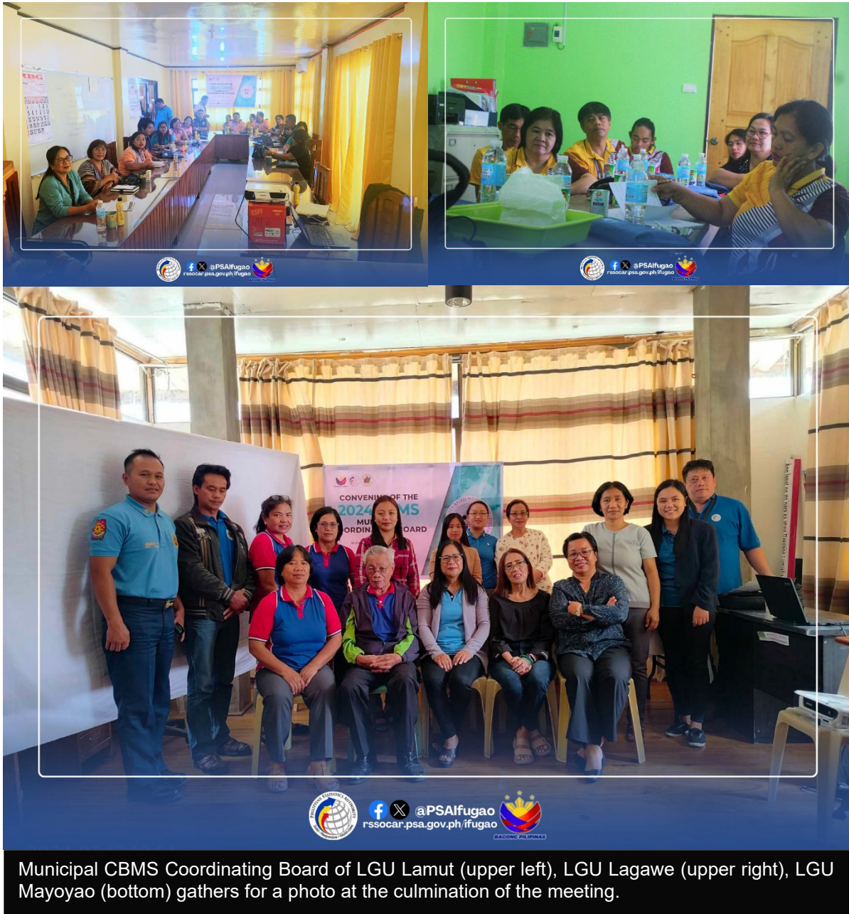
Municipal CBMS Coordinating Board of LGU Lamut (upper left), LGU Lagawe (upper right), LGU Mayoyao (bottom) gathers for a photo at the culmination of the meeting.

As Ifugao looks towards the successful implementation of CBMS, the conclusion of the Municipal CBMS Coordinating Board convenings signifies a collective step forward towards realizing this vision.