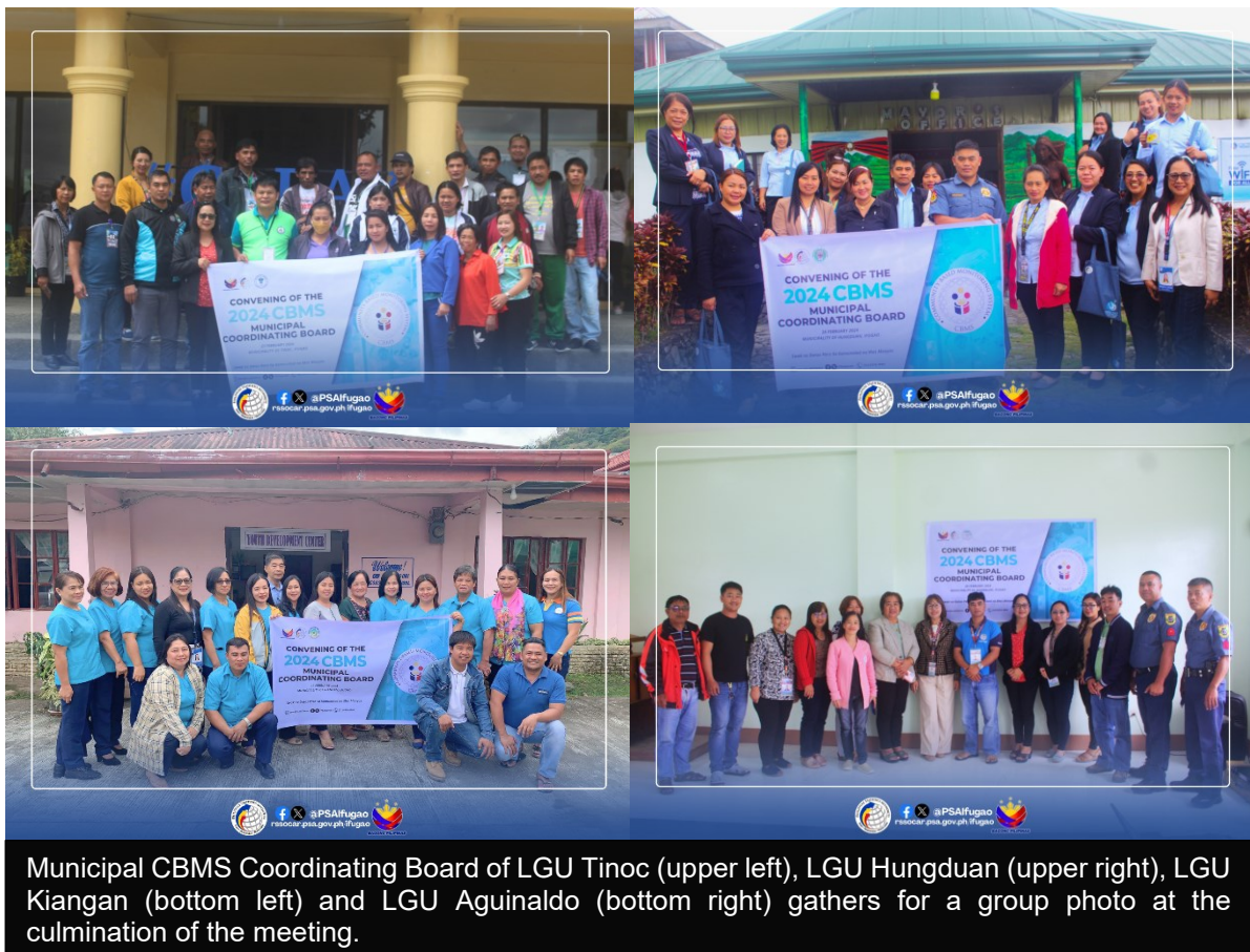
Municipal CBMS Coordinating Board of LGU Tinoc (upper left), LGU Hungduan (upper right), LGU Kiangan (bottom left) and LGU Aguinaldo (bottom right) gathers for a group photo at the culmination of the meeting.

Date of Release: 18 February 2024 Reference No. 2024-04