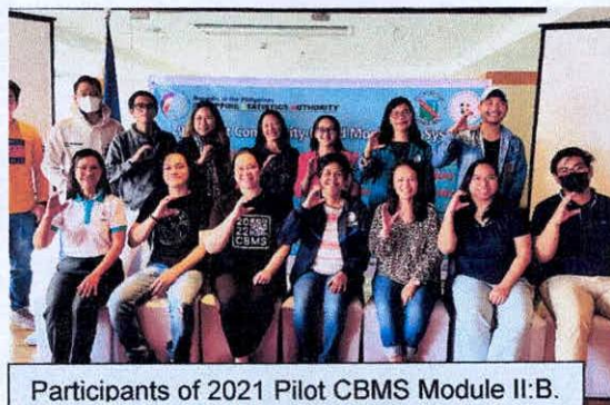
Participants of 2021 Pilot CBMS Module II:B.

The Philippine Statistics Authority (PSA)-Benguet Provincial Statistical Office together with the Regional and Central Office conducted a five-day statistical training for the 2021 Pilot CBMS Data Processing of Data Tabulation and Analysis Using Descriptive Statistics last 30 January to 04 February 2023; and one-day Data Review on 03 February 2023 at the Ion Hotel, Legarda Road, Baguio City. The training was designed to developed one's skill in generating various types of CBMS data tabulations using Census and Survey Processing System (CSPro) and Microsoft Excel applications. Moreover, the key data tables generated from the 2021 2QPilot CBMS was presented during the data review.