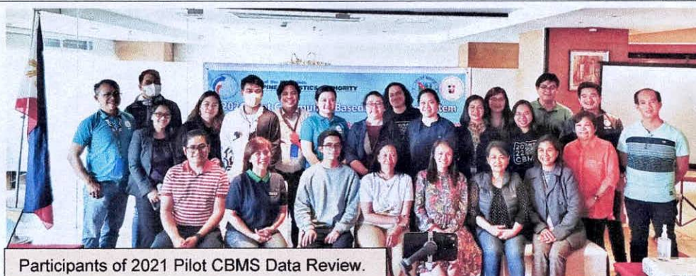
Participants of 2021 Pilot CBMS Data Review.