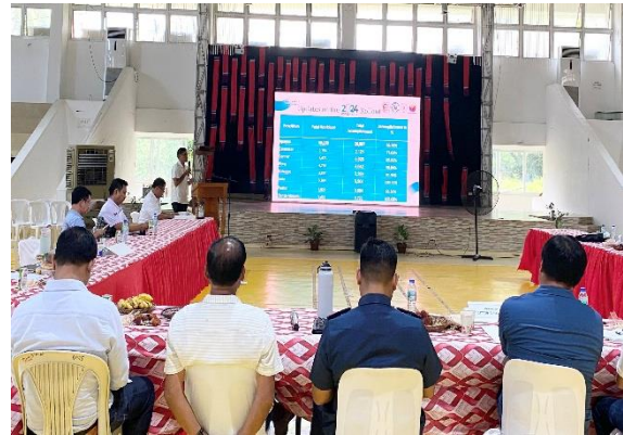
CSS Calimuhayan, discussing the updates on the 2024 POPCEN-CBMS.

The Kapehan was conducted on 09 September 2024 at EKB Jr. Evacuation Center and Multipurpose Gymnasium (Aliwa Gym).