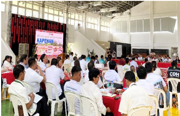
The secretariat acknowledging the guests and participants of the meeting.

Date of Release: 11 September 2024 Reference No.: 2024-031