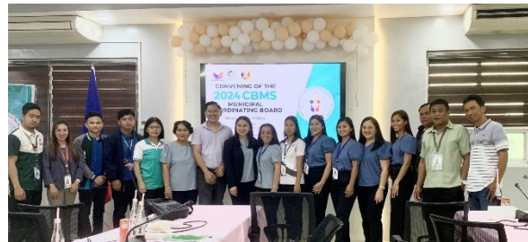
Convening of the Municipal CBMS Coordinating Board at Flora.

These two separate activities conducted in the municipal local governments of Santa Marcela and Flora were actively participated by the heads and representatives of various municipal offices, PNP, DepEd and DILG. The events concluded with summary of commitments to be consolidated by each Municipal Planning and Development Office (MPDO) before submitting to PSA-Apayao.