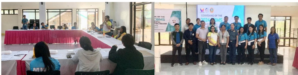
Convening of the Municipal CBMS Coordinating Board at Santa Marcela.

A team of the Philippine Statistics Authority (PSA) in Apayao led the convening of two (2) 2024 Municipal Community-Based Monitoring System (MCCB) on February 27, 2024 that took place at the EKB Clubhouse of Santa Marcela in the morning, and at the Municipal Conference Hall of Flora in the afternoon.