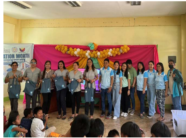
Photo taken during the gift-giving activity and IAC, showing the commitment of PSA-Apayao to make a positive impact.

The Civil Registration Month is celebrated in February of every year pursuant to Proclamation No. 682 signed by the former President Corazon C. Aquino on 28 January 1991. This 34 th annual celebration aims to remind the Filipinos of their duty to register acts and events concerning status of persons, enhance nationwide awareness, and appreciation of the legal, administrative, and statistical values of civil registry documents.