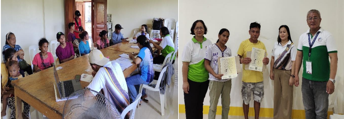
Mobile registration and distribution of SecPa in Malayugan, Flora

Date of Release: 16 September 2024 Reference No.: 2024-032