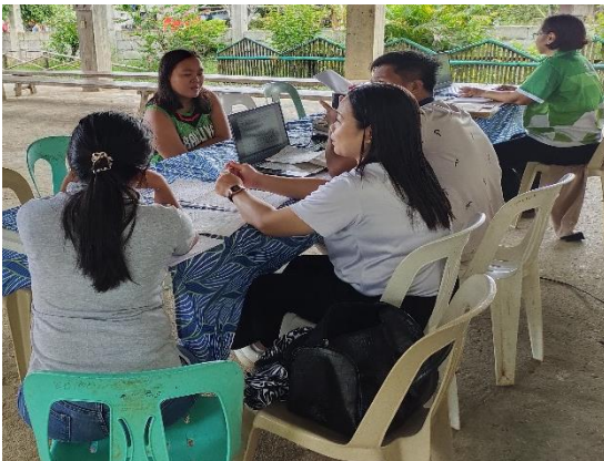
Mobile registration in Barangay Balluyan

Twenty-nine clients for the Birth Registration Assistance Project (BRAP) were served during the mobile registration in Barangays Malayugan and Balluyan, Flora last September 11-12. All of them have complied with their lacking documents prior to registration at the Local Civil Registry Office (LCRO), and were all enlisted for verification. Meantime, five beneficiaries of BRAP in Malayugan also received their PSA live births in security paper last September 11 through the collaborative efforts of PSA Apayao and LCRO.