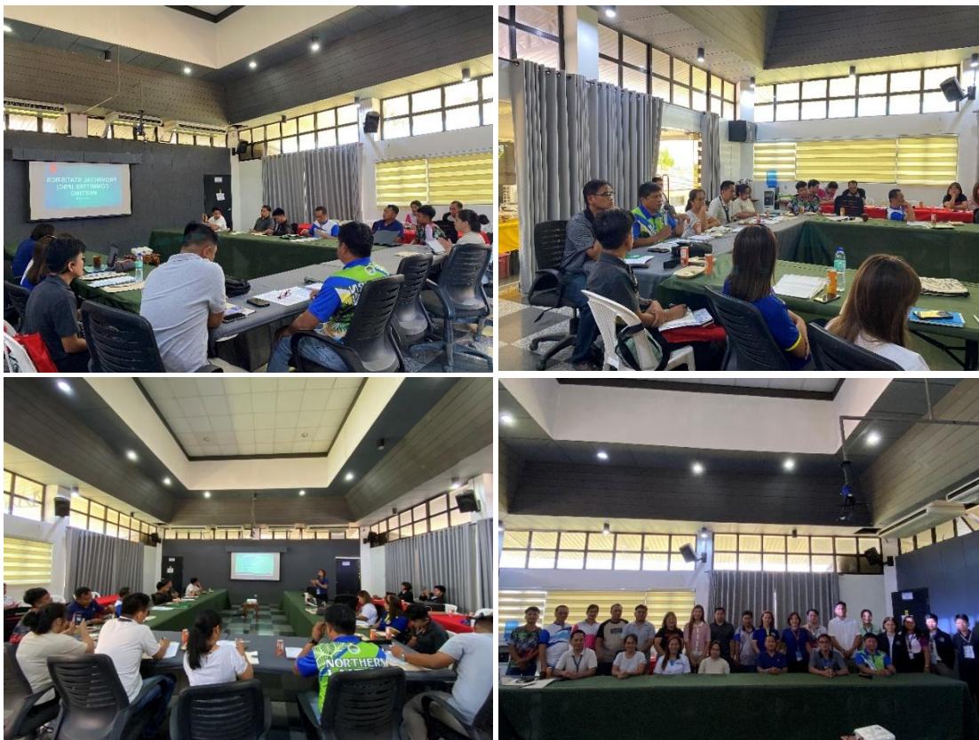
Photos during the meeting and a group picture after it adjourned.