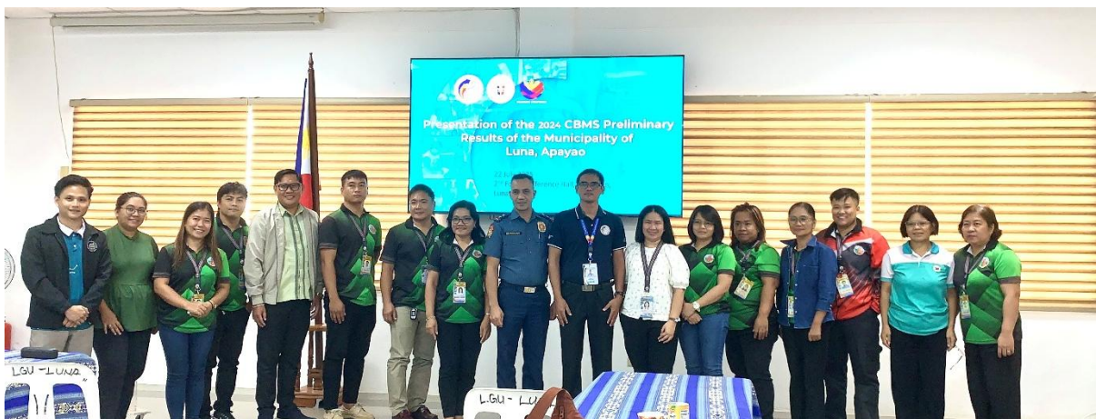
Group picture after the activity.