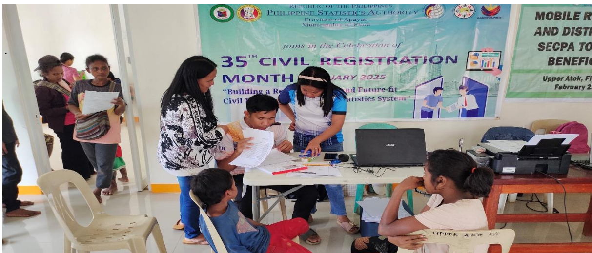
LCRO personnel from LGU Flora conducting mobile registration at Upper Atok, Flora on February 21.