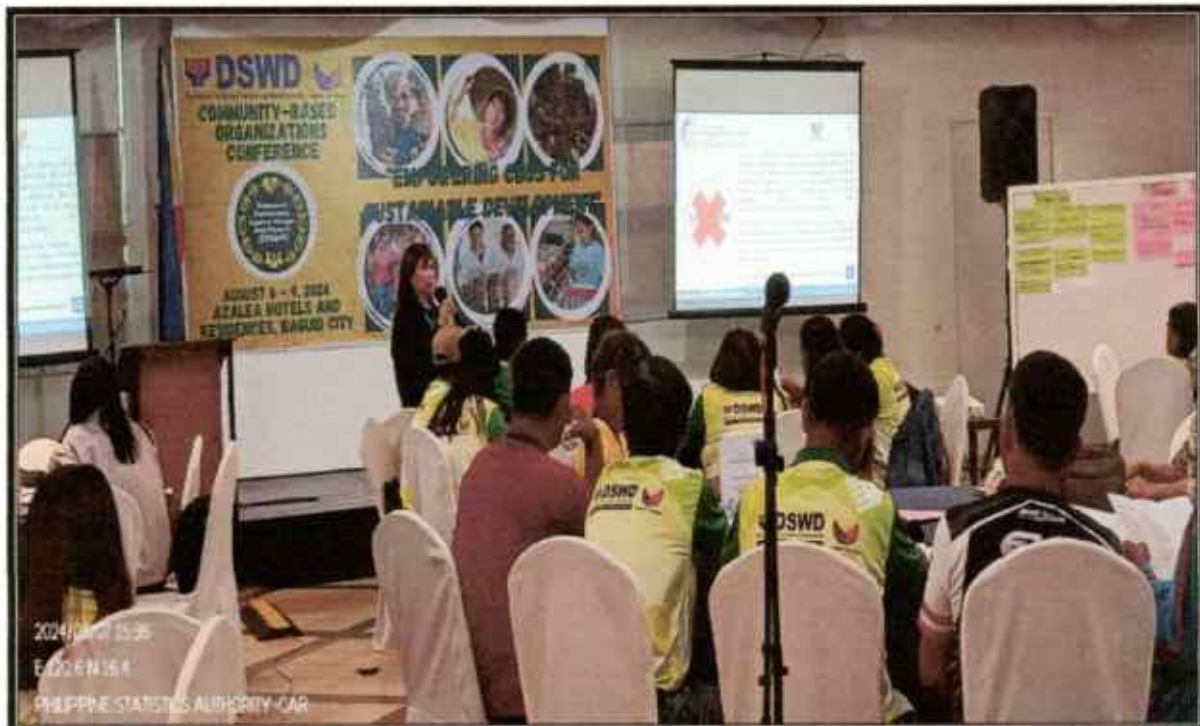
PhilSys staff presenting PhilSys information and education materials during the EPAHP Conference on August 07, 2024.

Date of Release: 27 August 2024 Reference No. 2024 – 013