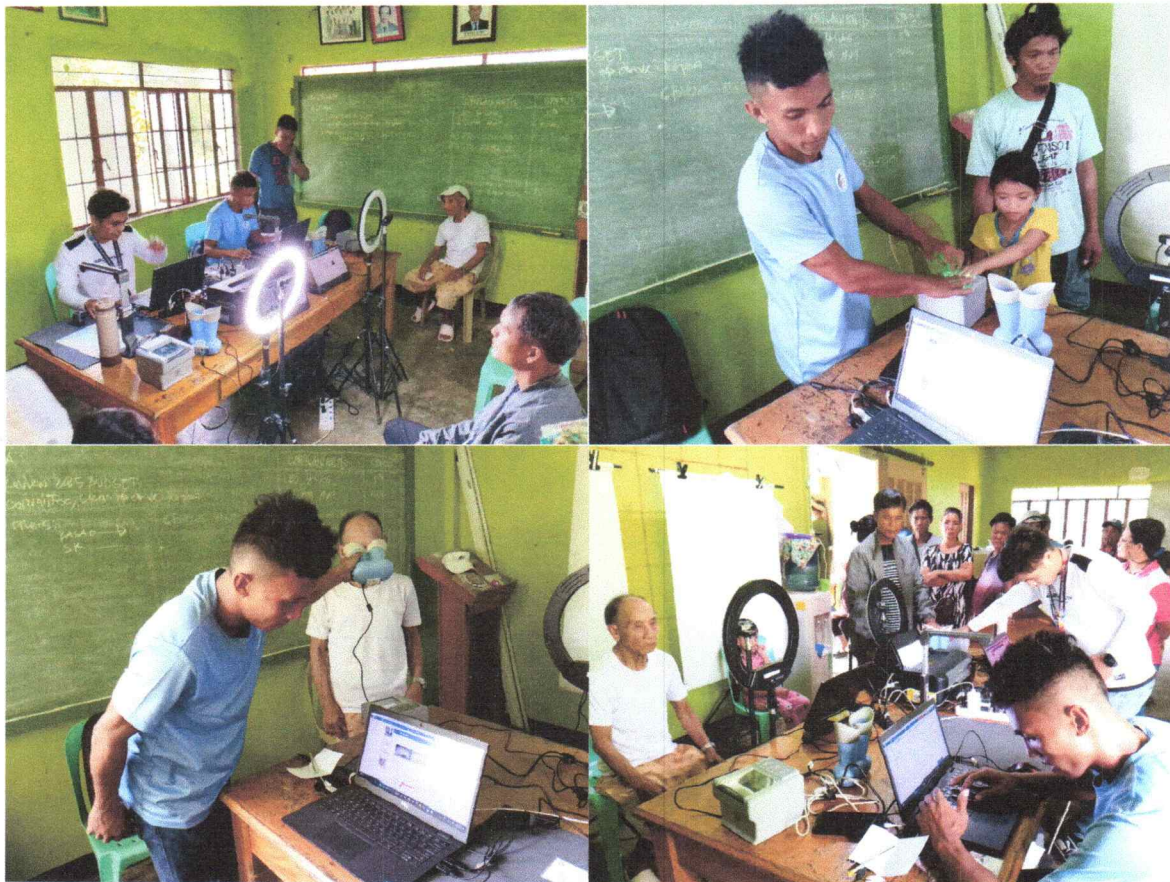
Philippine Statistics Authority – Kalinga registered the Pantawid Pamilyang Pilipino Program beneficiaries in the National ID System during the Family Development Session held at Nambaran, Tabuk City, Kalinga on November 19, 2024.

Tabuk City, Kalinga – In line with its ongoing efforts to make National ID services more accessible to Filipinos, particularly beneficiaries of the Pantawid Pamilyang Pilipino Program (4Ps), the Philippine Statistics Authority (PSA) Kalinga extended National ID services during a Family Development Session (FDS) in Nambaran, Tabuk City held on November 19, 2024.