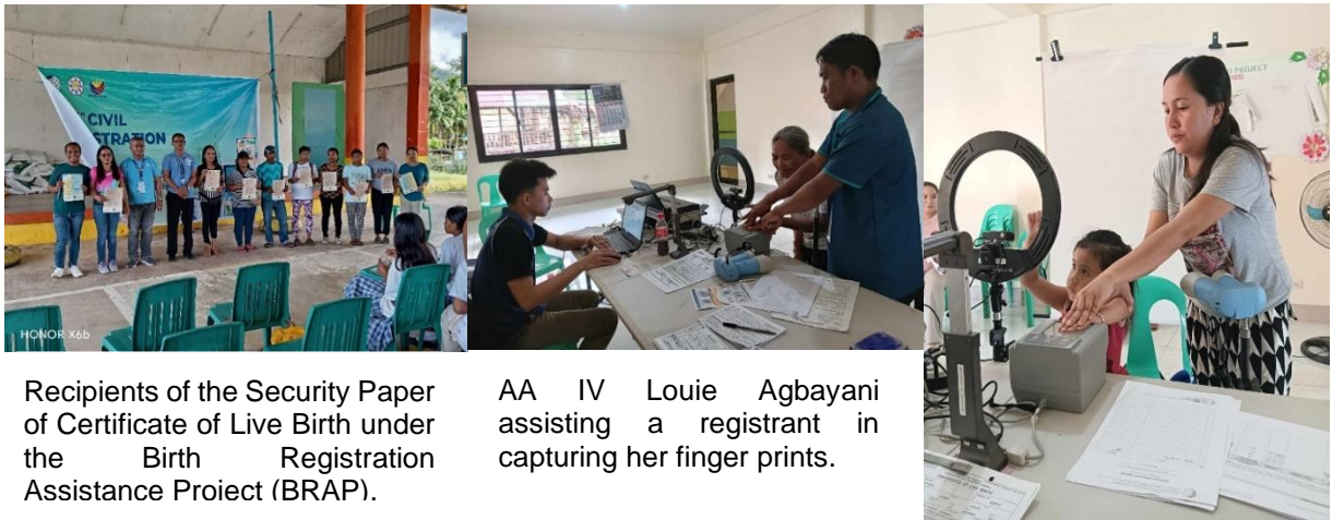
Recipients of the Security Paper of Certificate of Live Birth under the Birth Registration Assistance Project (BRAP).