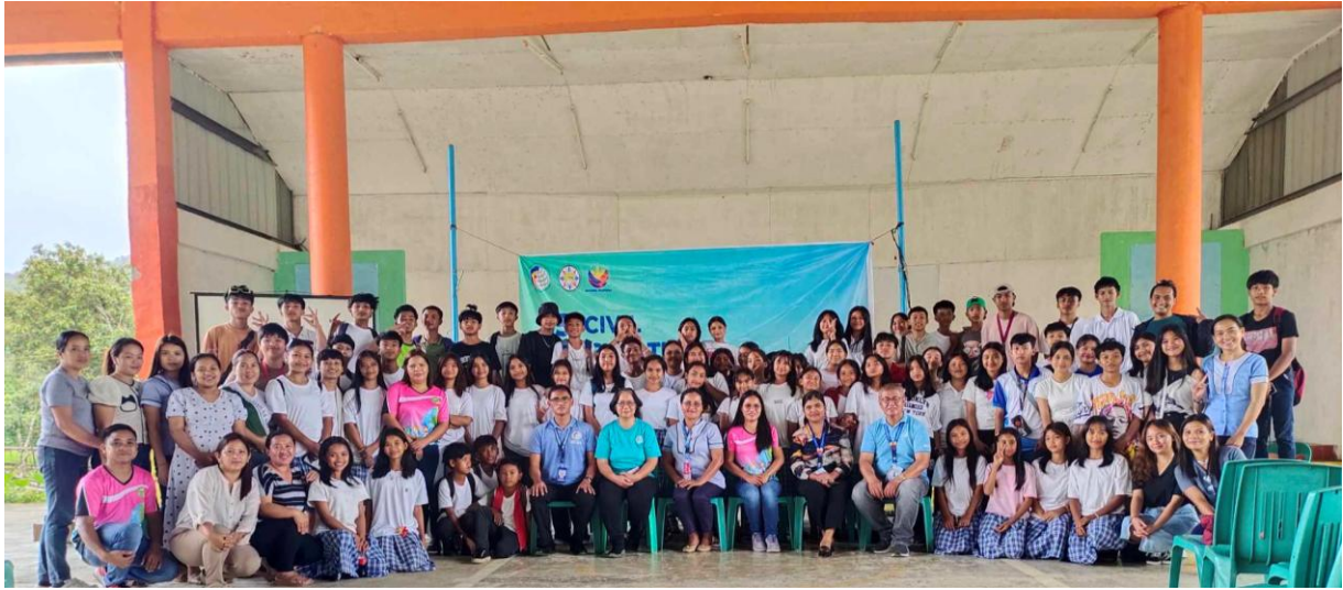
Group picture with participants who are students and teachers.