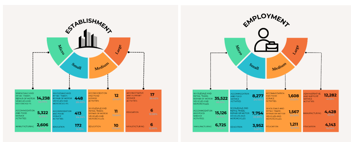
Figure 2. Top 3 Industry Section by Number and Total Employment of Establishments in Operation, by Employment Groupings, CAR: 2023 LE

For the Small and Micro employment groups, the top three industry sections - in no particular order - were Section G, Section I, Section C, and Section P.