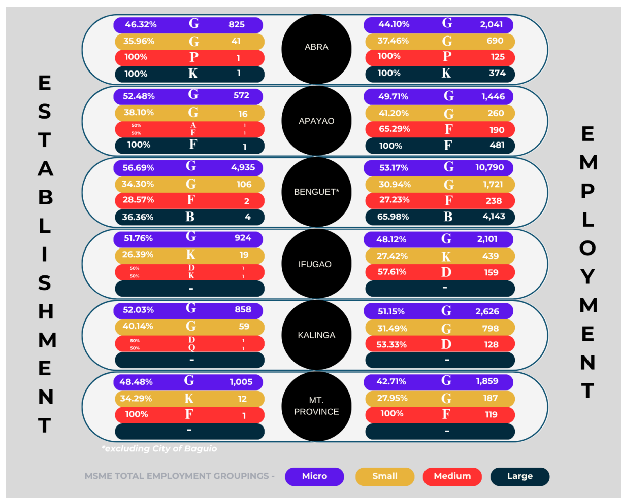
Figure 3. Top Industry Sections by Number and Total Employment of Establishments in Operation, by Province and Employment Groupings, CAR: 2023

Meanwhile, in Ifugao, the leading industry within the Small group was Financial and Insurance Activities (Section K), comprising 26.39% of establishments and employing 439 individuals.