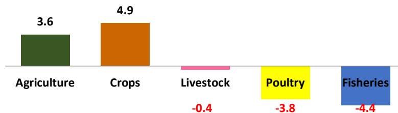
Fig. 1 Growth Rates of Value of Production in Agriculture at Constant 2018 Prices, CAR, 2018-2019

Agriculture grew by 3.6 percent in 2019. Only the crops sub-sector contributed to the higher production. At current prices, the gross value of agricultural production amounted to PhP 27,554 million, lower by 8.1 percent than the previous year's level (Table 2). From January to December 2019, total volume of agricultural production increased by 4.8 percent, from 1,147 thousand metric tons to 1,202 thousand metric tons (Table 3).