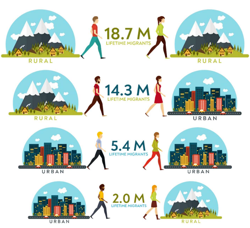
Figure 2. Population Aged 15 and Over by Lifetime Migration Flow, Philippines: 2018