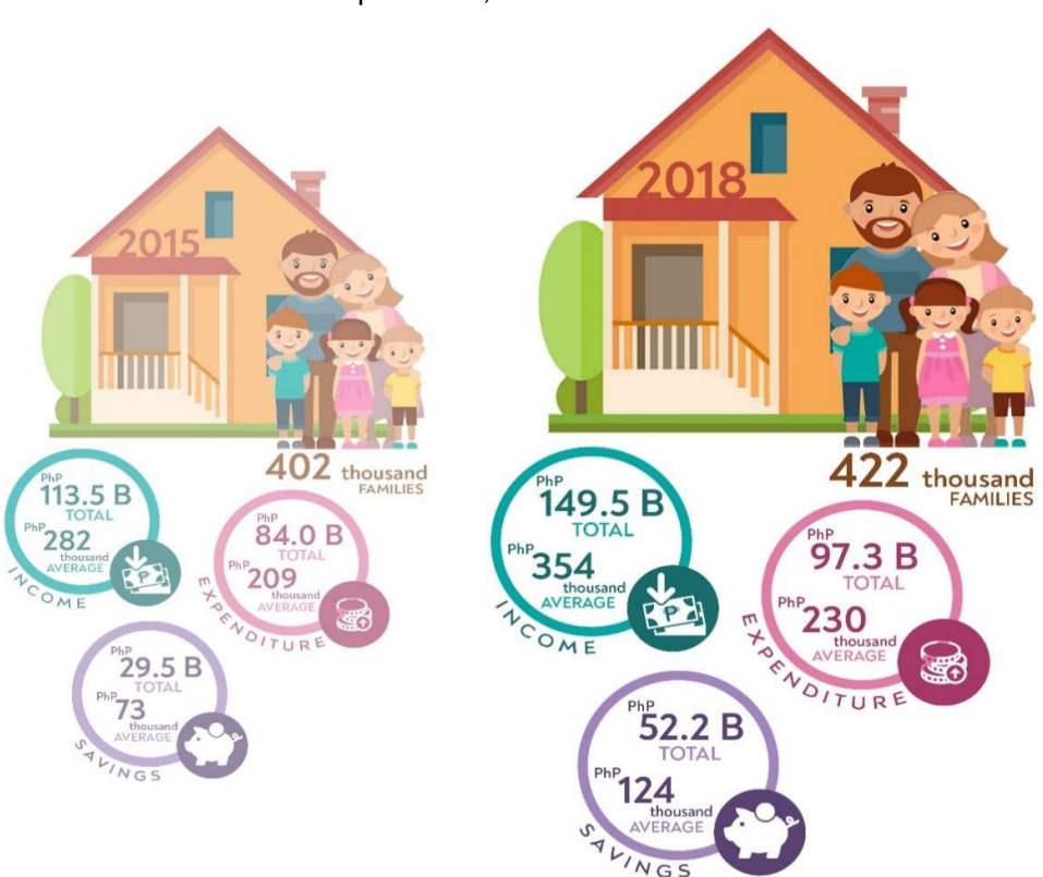
Figure 1. Number of Families, Total and Average Annual Family Income and Expenditure, CAR: 2015 and 2018

In 2018, families in the Cordillera Administrative Region (CAR) had an average annual family income of 354 thousand pesos. In comparison, the annual expenditure for the same year was 230 thousand pesos on average. These figures meant an average annual saving of 124 thousand pesos per family.