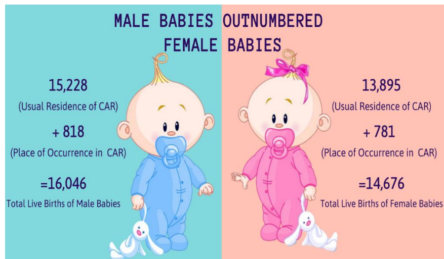
Figure 1. Number of Live Births by Sex, by Place of Occurrence, and by Usual Residence of Mother, CAR: 2018