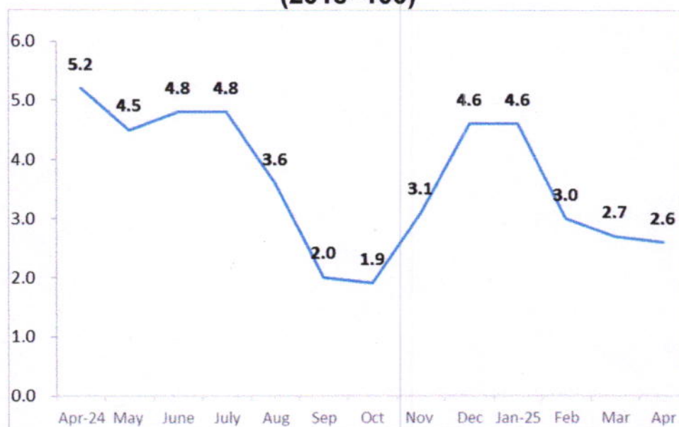
Figure 1. Headline Inflation Rates in Baguio City, All Items (2018=100)