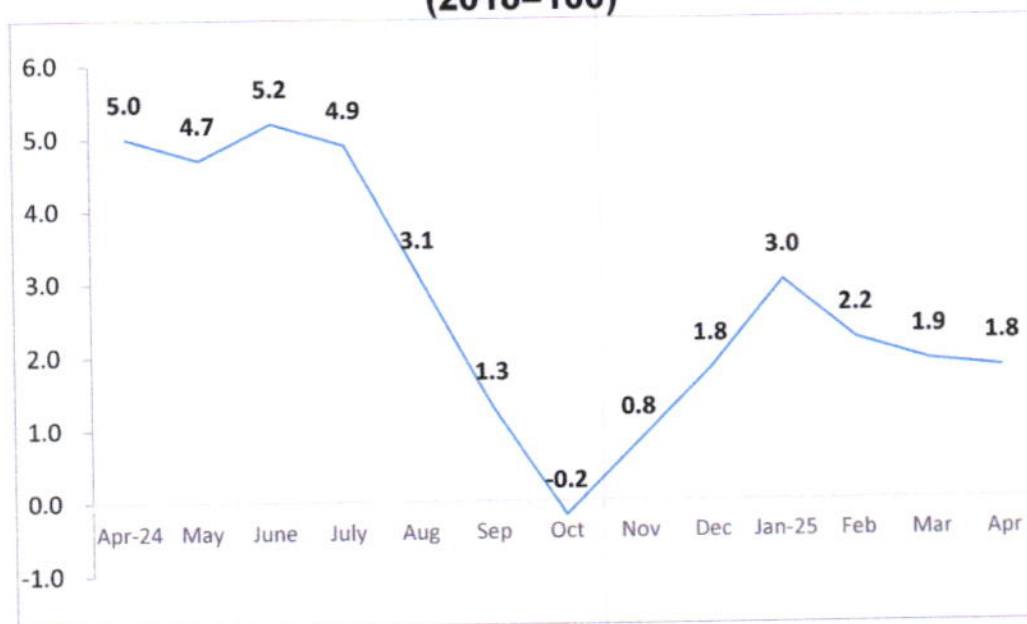
Figure 1. Headline Inflation Rates in Benguet, All Items (2018=100)