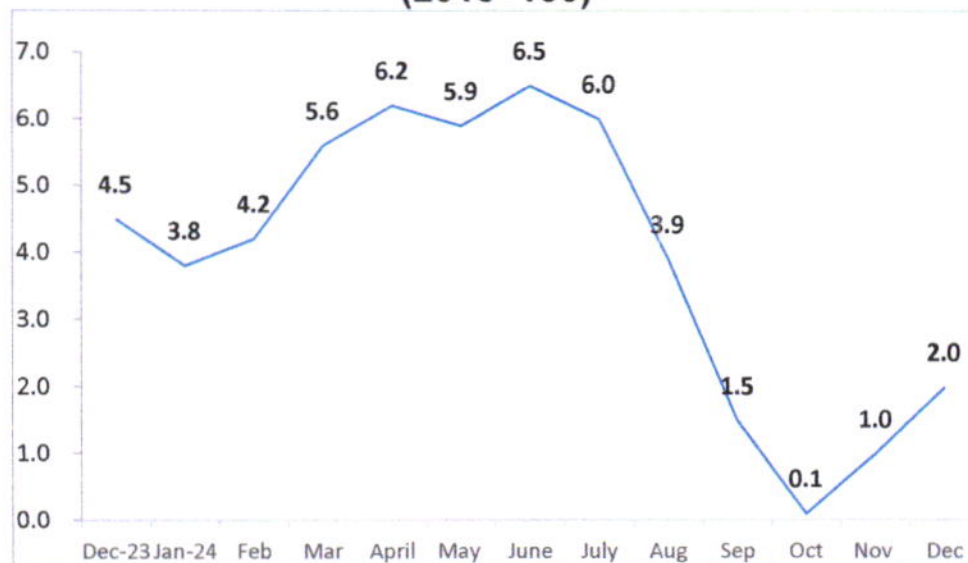
Figure 1. Headline Inflation Rates in Benguet, All Items (2018=100)

Source: Retail Price Survey of Commodities for the Generation of Consumer Price Index, Philippine Statistics Authority