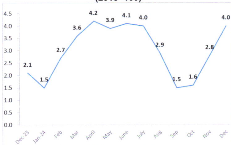
Figure 1. Headline Inflation Rates in Baguio City, All Items (2018=100)