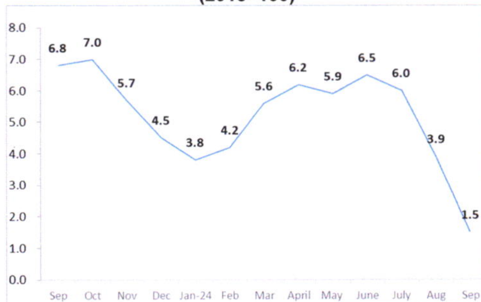
Figure 1. Headline Inflation Rates in Benguet, All Items (2018=100)