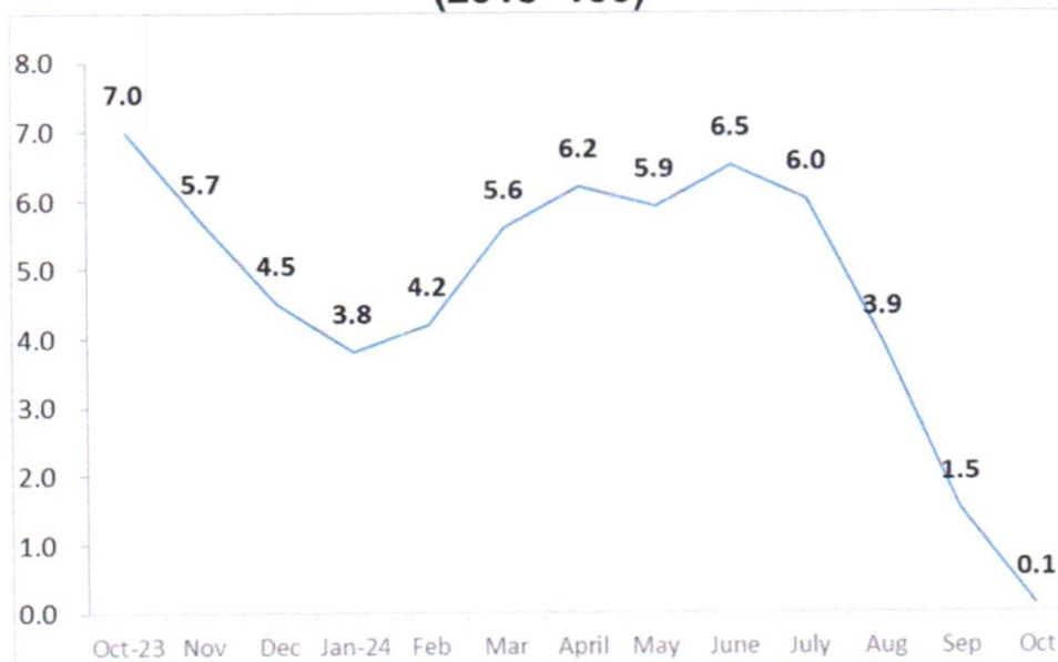
Figure 1. Headline Inflation Rates in Benguet, All Items (2018=100)