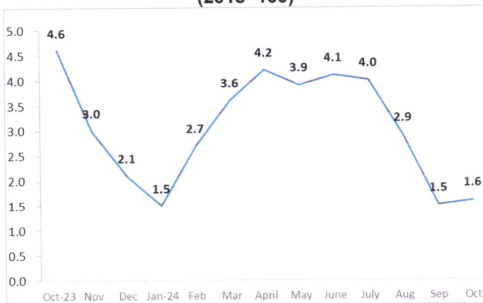
Figure 1. Headline Inflation Rates in Baguio City, All Items (2018=100)